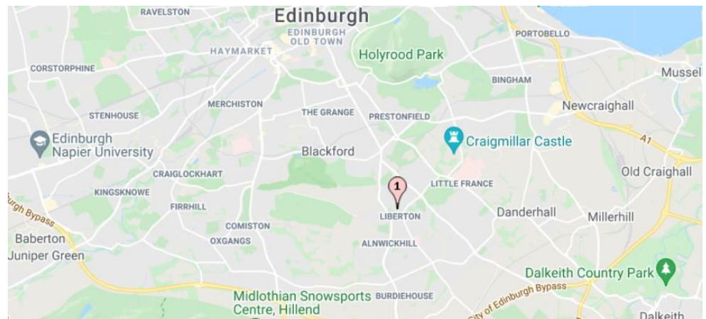
Fig. 1 – John STODART is recorded at Liberton from 1565, marked as '1' on the map.

From here, the records seem a little more logical. The next few generations are recorded as living in the same general area, near Edinburgh.